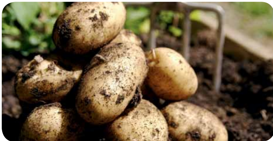
Seamungus is perfect for growing your own vegetables