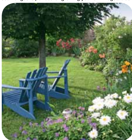
Use Seamungus to revitalise your garden